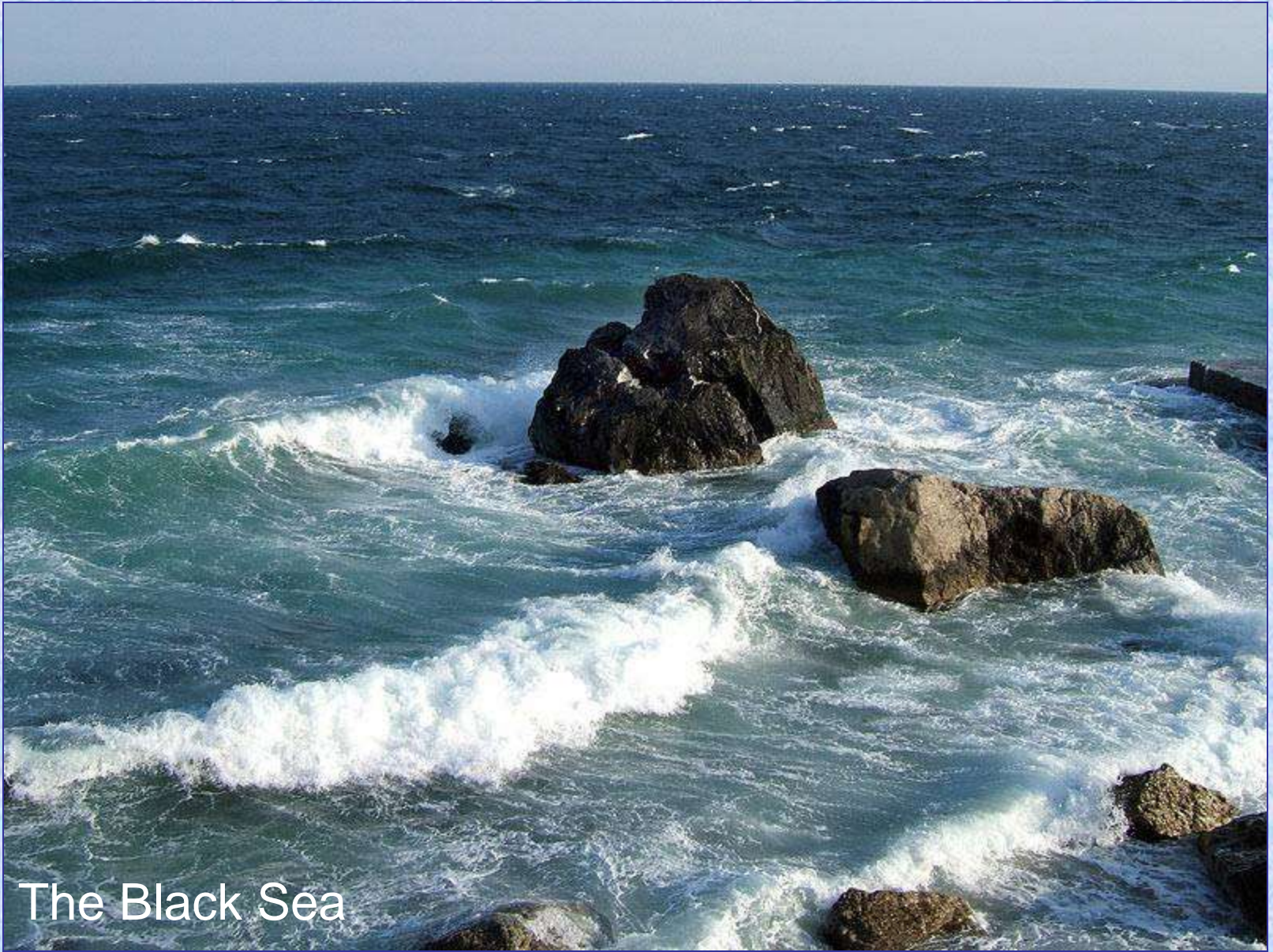
The Black Sea