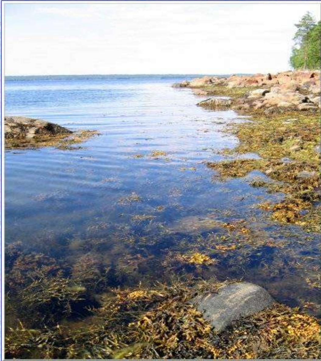
The White Sea